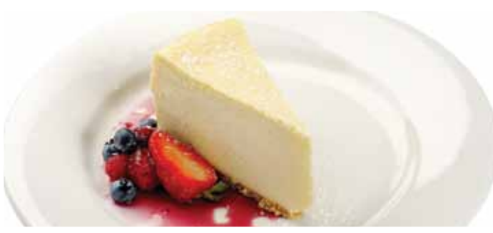
PLATINUM A traditionally prepared creamy New York cheesecake on a biscuit crumb base.