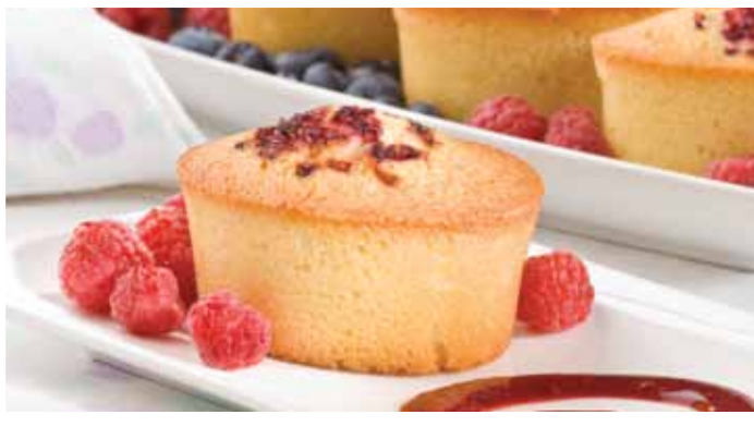
RASPBERRY (Gluten Free) Traditional recipe of almond meal baked with raspberries.