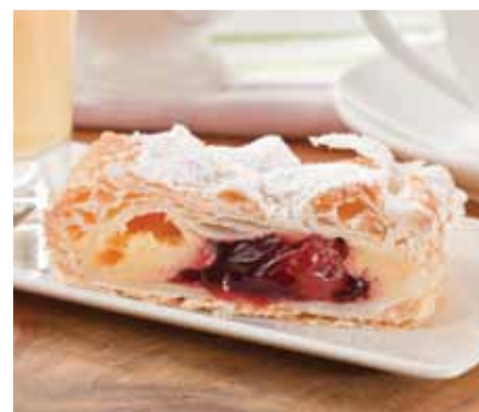
CHERRY STRUDEL Delicious cherries encased in baked vanilla custard, wrapped in flaky puff pastry, dusted with icing sugar. Enjoy served warm.