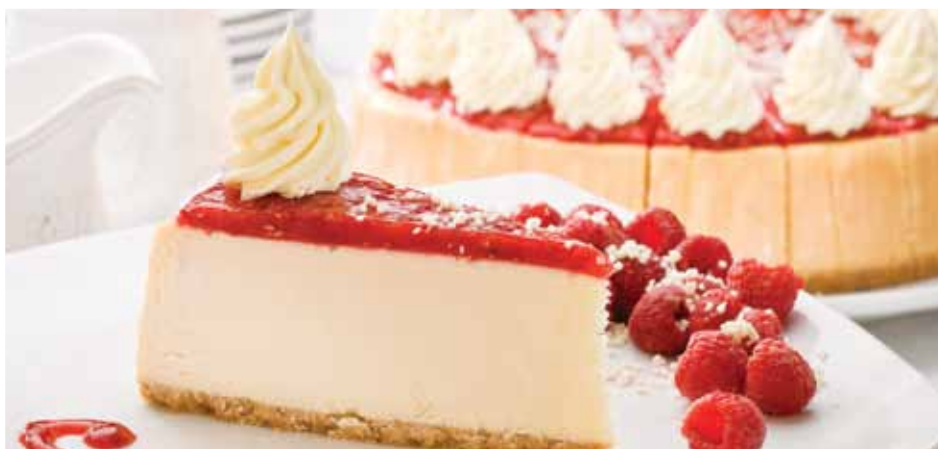
RASPBERRY NEW YORK A traditionally prepared creamy New York cheesecake, topped with delicious raspberries and a white chocolate ganache peak.