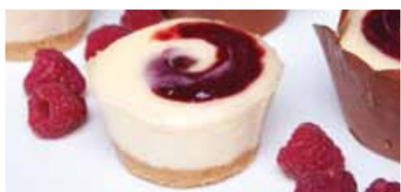
RASPBERRY A generous swirl of raspberry through our smooth and creamy baked cheesecake on a biscuit crumb base.