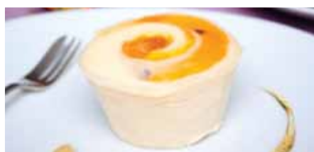
PEACH & PASSIONFRUIT (Gluten Free) Tropical blend of peach and passionfruit swirled through our smooth and creamy baked cheesecake.