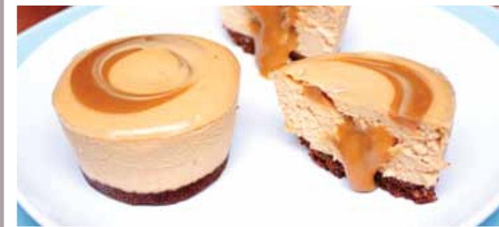
CARAMEL Caramel baked cheesecake with a swirl of molten caramel through the centre, sitting on a chocolate biscuit base.