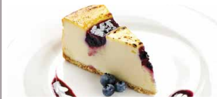
BLUEBERRY BRULEE Our famous New York cheesecake with a generous swirl of white cream and a brulee finish.