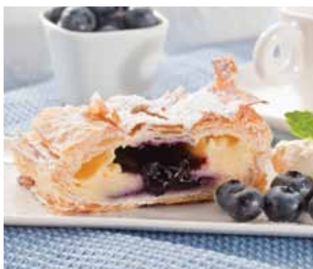
BLUEBERRY STRUDEL Fruity blueberries encased in baked vanilla custard, wrapped in flaky puff pastry, dusted with icing sugar. Enjoy served warm.