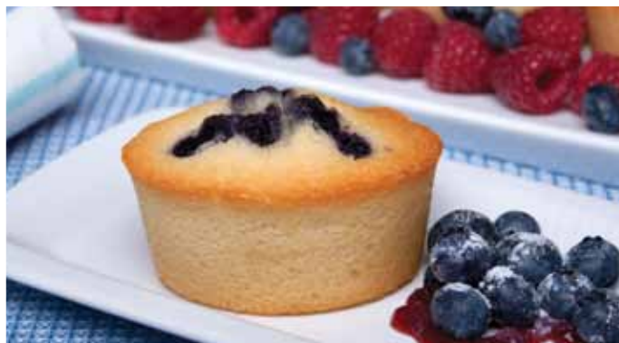
BLUEBERRY (Gluten Free) Traditional recipe of almond meal baked with blueberries.