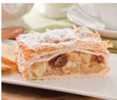
APPLE STRUDEL Apples and sultanas with a hint of spice wrapped in flaky puff pastry, dusted with icing sugar. Enjoy served warm with custard and ice cream.