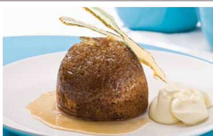
SELF SAUCING STICKY DATE A traditional style pudding, full of dates with a self saucing butterscotch sauce.