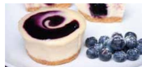
BLUEBERRY A generous swirl of blueberry through our smooth and creamy baked cheesecake on a biscuit crumb base.