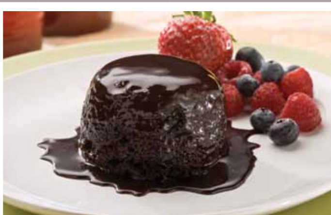
SELF SAUCING CHOCOLATE One for the chocolate lovers, a chocolate pudding with a self saucing chocolate sauce.