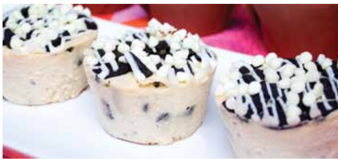
COOKIES & CREAM For the young and young at heart. Our baked cheesecake loaded with chocolate biscuit pieces topped with biscuits white chocolate pieces and drizzle.